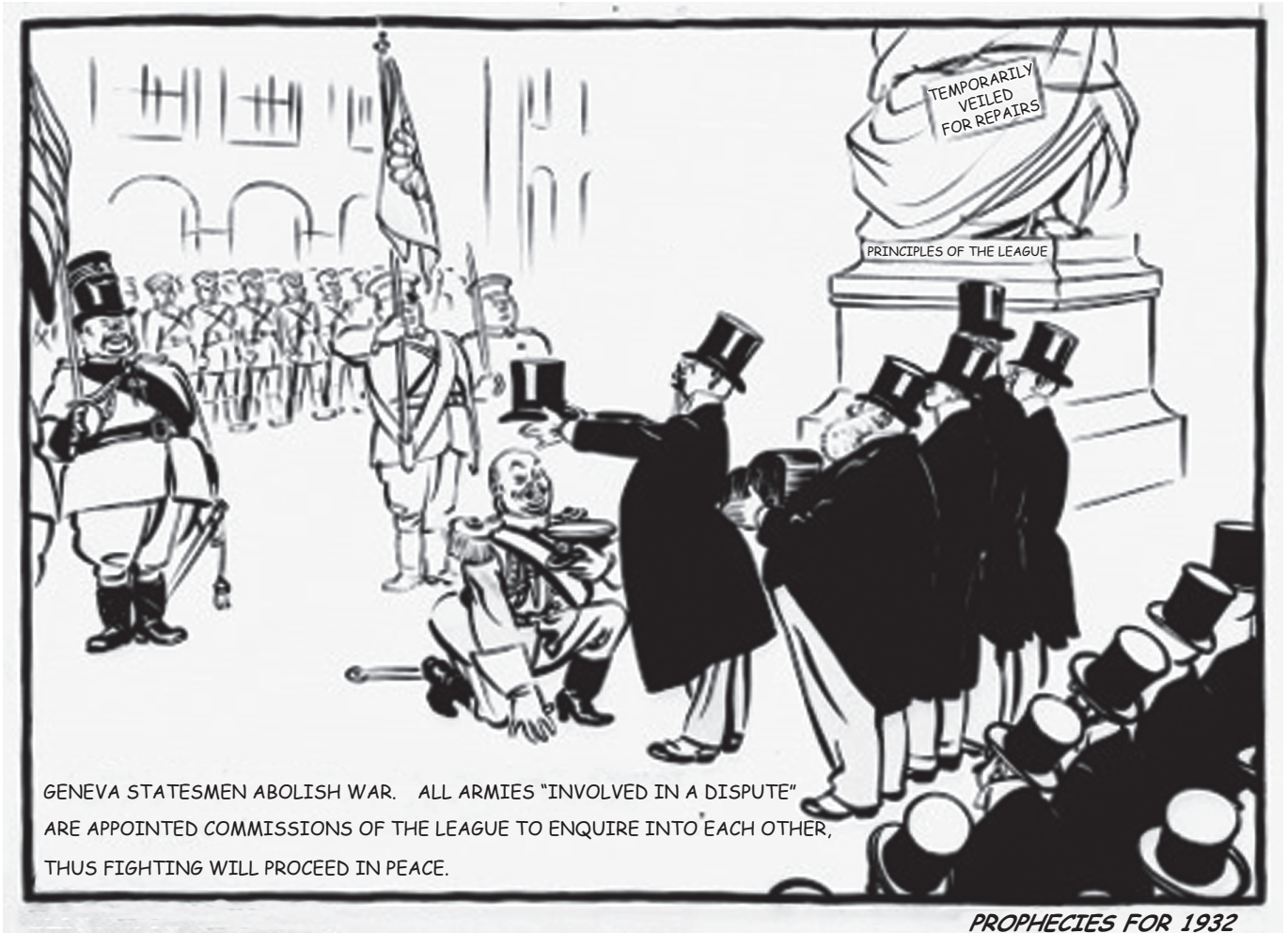
A British cartoon published in December 1931.