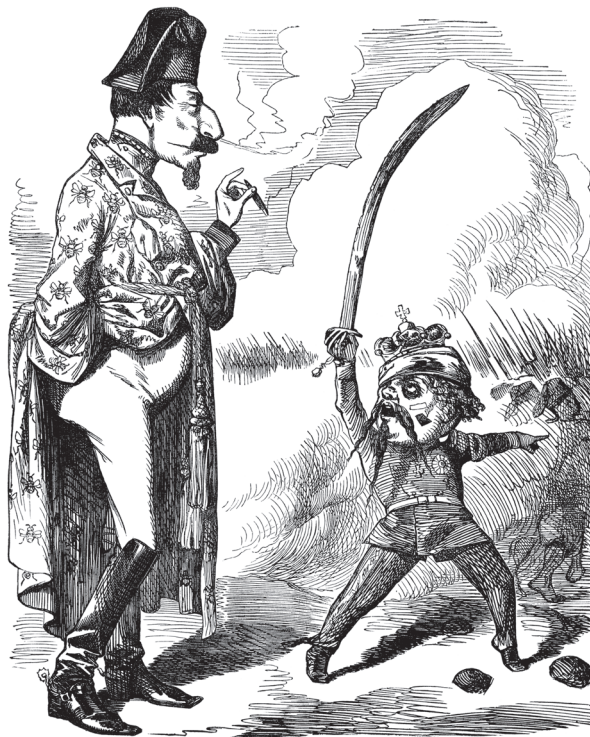
THE GIANT AND THE DWARF.

A cartoon published in Britain in June 1859. Napoleon III, on the left, is saying to Cavour, 'Bravo, my little fellow! You shall do all the fighting and we'll divide the glory.'